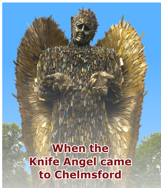
When the Knife Angel came to Chelmsford

and check out essex.police.uk and chelmsfordandmaldonnhw.org.uk/fraudscamhelp.html