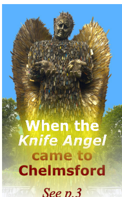
When the Knife Angel came to Chelmsford